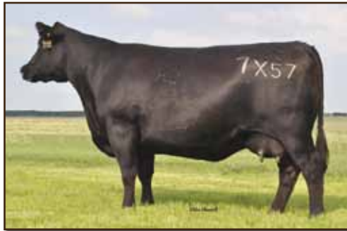
Sinclair Blkbird 7X57 7078, maternal sister to 1S2 and 1S3, sired by EXT