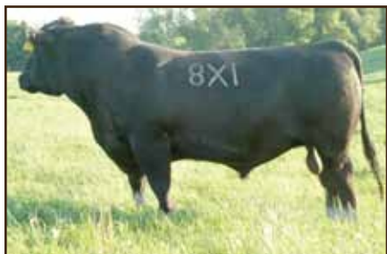
CFC Genesis 8X1, full brother to JGM Sure Thing 614S, raised by Chrisman Family, co-owned with Sinclair