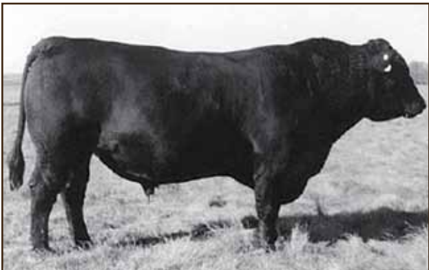
OCC Exclamation 785E, MGS of OAU1