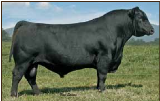
Rito Revolve OR5, sire of 1R1