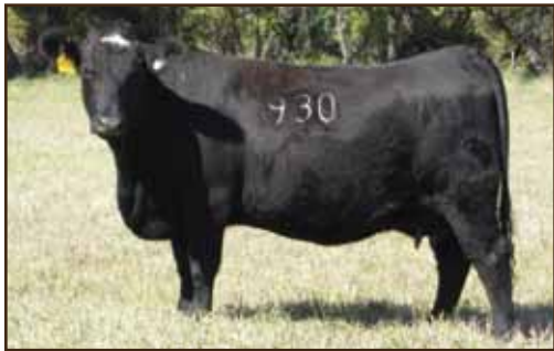
CFC Eola 930W, another young halfblood Angus x Fleckvieh cow