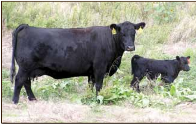
JGM Lady Bonnie 353N, daughter of Power Alliance pictured at 6 years of age

Big and stout, out of a really solid old cow, his EPDs far underestimate the performance he will sire. Ratioed 102 for yearling and scanned good too, 102 ribeye ratio and 109 for IMF.