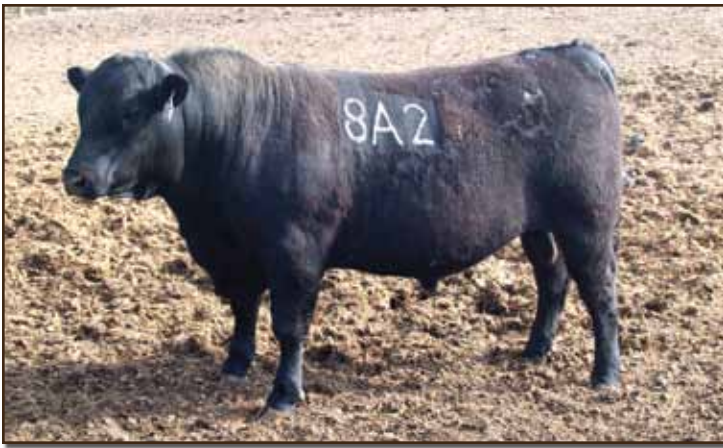
JGM Ultimate 8A2, Power Alliance son out of 796C donor, we lost the bull early in life to an accident but the few progeny we have are exceptional quality