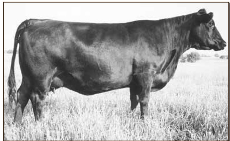
CM Dixie Erica 796C, dam of JGM Utmost 8A2, also the dam of JGM Sure Thing 614S and CFC First Step 9V1 who also have sons in this offering.