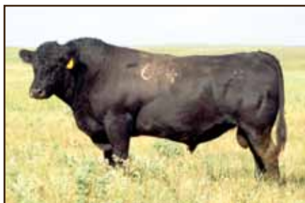
JGM Sure Thing 614S, his influence is strong in the offering, sire of OXS1, OXS3 and OXS9