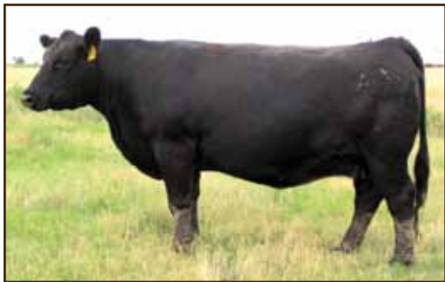
CFC Peridot 621S, dam of 031X