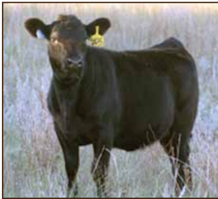
"The Keeping Kind" JGM Utmost 8XS14 x OCC Emblazon 854E heifer calf pictured in early September 2010.

Big, stout, and masculine - he ratioed 111 for weaning, 109 for ribeye and looks the part.