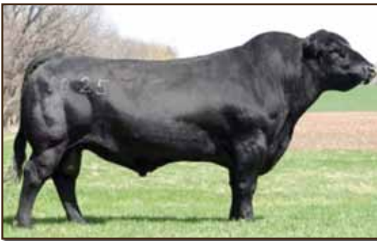
HA Power Alliance 1025 - Sire of JGM Ultimate 8A2 and MGS of OU17

Heifer bull. Ratioed 95 for BW, 107 WW, 103 YW, and 110 IMF, dam has avg BW ratio of 95 and avg WW ratio of 106 and is one of the best cows we own.