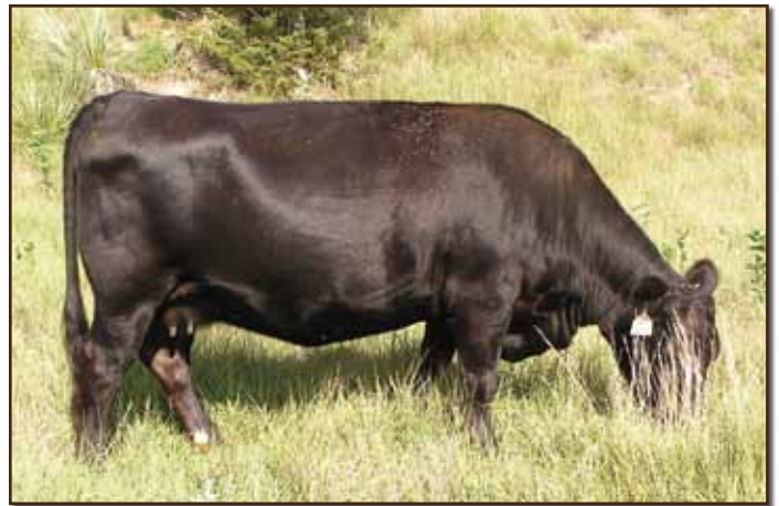
Sinclair K BTY 6P78 3G21, dam of OXS9

Heifer bull with extra length and a 103 weaning ratio, calving ease on Great Plains genetics is outstanding.