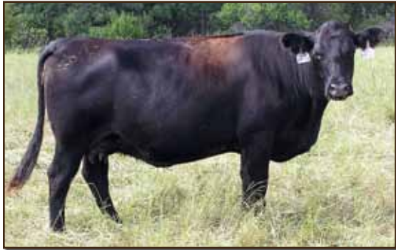
Sinclair C Pride 6PF14 - Dam of 1C3

Cole Creek Black Cedar 46P - Proven total performance sire produced in the real world short grass country of Southern Montana by Greg Golden at Cole Creek Angus where they have been producing Angus cattle for 50 years. They run their cowherd tougher than any registered operation I have ever seen and still demand performance. We want our cows to bring in the pounds on low quality forage and think this bull will help us do that. You will see several sons and grandsons in the years to come.