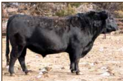
CFC First Step 9V1, grandson of EXT raised by Chrisman Family, sire of 1V4