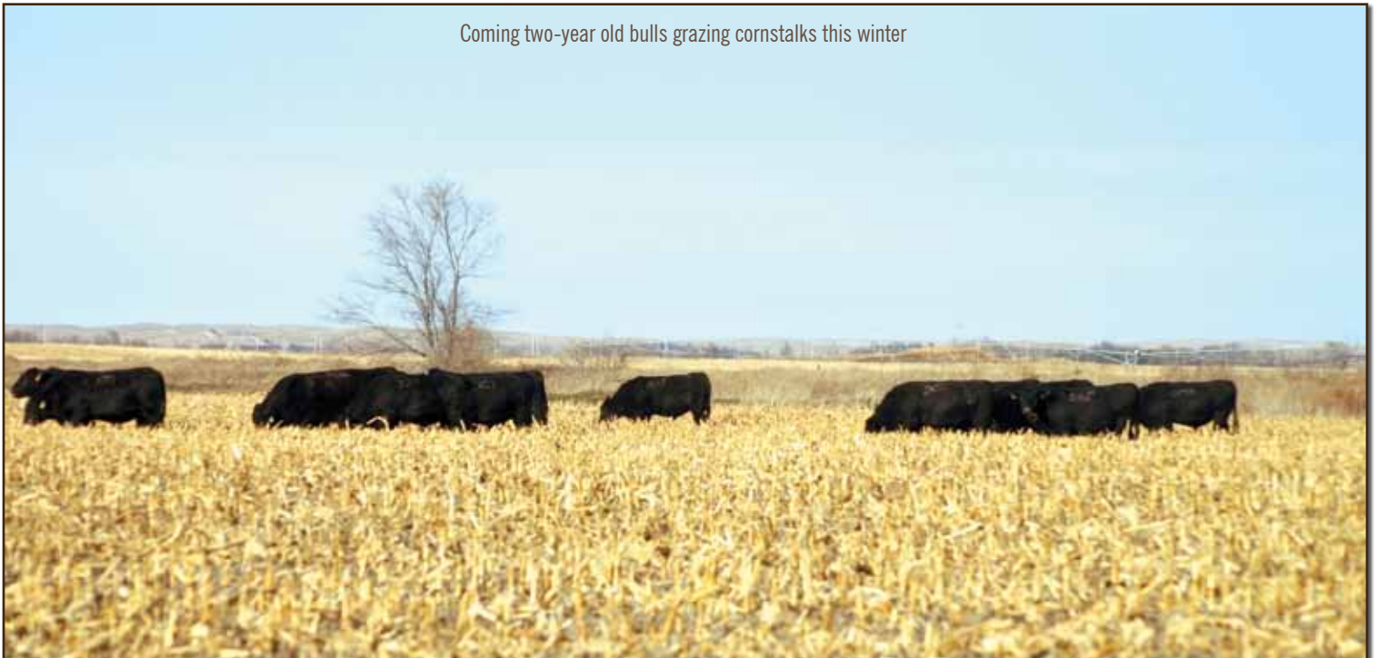
Coming two-year old bulls grazing cornstalks this winter

We guarantee the bulls against injury or death during the first breeding season. We also guarantee your satisfaction with the bull. If for any reason the bull is not satisfactory, is injured, or dies, you receive credit for the purchase price less any salvage value.