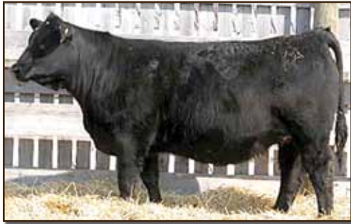
85T, Halfblood Angus x Fleckvieh, dam of JGM Ultimate 003

Pictured below is a halfblood Angus/Fleckvieh Simmental female co-owned by the Chrismans and the Martins. She is the model for our SimAngus females. Stay tuned for more of these good composite bulls. They will offer more muscle and growth than the straight Angus, with the benefit of maternal heterosis on the female side.