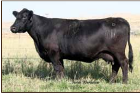
N Bar Primrose 4324B, grandam of 1SR1