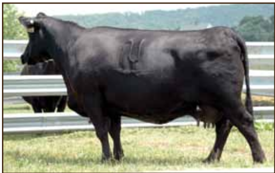
N Bar Queen Mother 9955F - Dam of 1R1, pictured at 15